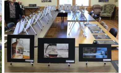
"Maple Season" art exhibit by Beaver River 10th and 11th graders.